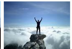
Flourishing and Thriving.