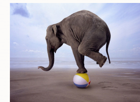
Work life Balance and Balancing energy for tasks.

Understanding of some important spiritual /psychological boundaries and how boundaries can be too rigid or too diffuse. The ability to move people from their valleys to a new place of hope will be taught and counselling skills of valley mapping, reflection, paraphrasing, active listening all taught through live demos & case work work .