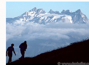
Strength For The Journey.

We will introduce you to the art of communication and teach you about the 5 levels of communication, communication traps, and defensive stances in communication. We introduce you to a 3 stage counselling model which teaches you 1. How To Explore with a client. 2 How to offer insight and understanding. 3. How to help the client move on.