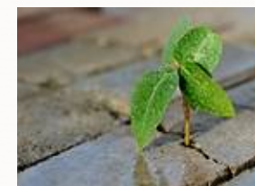
Post- traumatic growth! Tri- dimensional healing.

With many broken hearts and negative emotions disempowering many people, this module will examine the root of negative emotions. God has created us with amazing potential and resilience. Spiritual truths will give insights and keys to healing the broken heart. We will open up closed areas of your life and help you to find the turning points to transformation that you can then use with others .