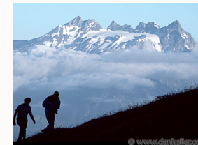
Strength For The Journey.

We will introduce you to the art of communication and teach you about the 5 levels of communication, communication traps, and defensive stances in communication. We introduce you to a 3 stage counselling model which teaches you 1. How To Explore with a client. 2 How to offer insight and understanding. 3. How to help the client move on.