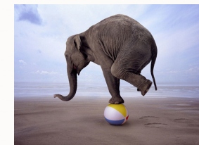
Work life Balance and Balancing energy for tasks.

Understanding of some important spiritual /psychological boundaries and how boundaries can be too rigid or too diffuse. The ability to move people from their valleys to a new place of hope will be taught and counselling skills of valley mapping, reflection, paraphrasing, active listening all taught through live demos & case work work .