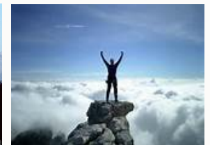
Flourishing and Thriving.